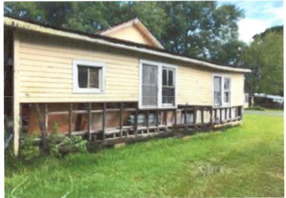
1606 Maude Avenue